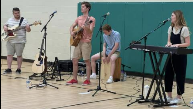
A great time was had by all!

Thank you to everyone who came out for our "Celebrating Divine Mercy" with We the Least