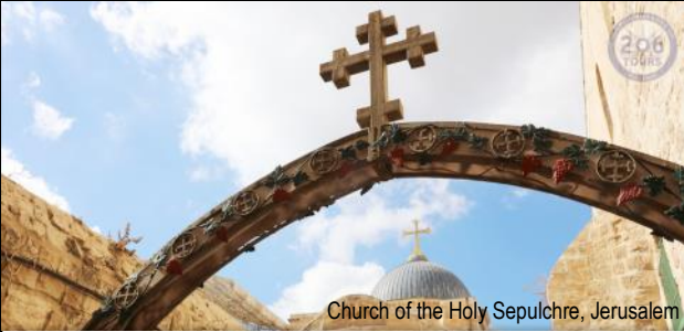
Church of the Holy Sepulchre, Jerusalem