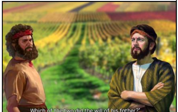
Which of the two did the will of his father?

He changed his mind and went. Tax collectors and prostitutes are entering the Kingdom of heaven before you.