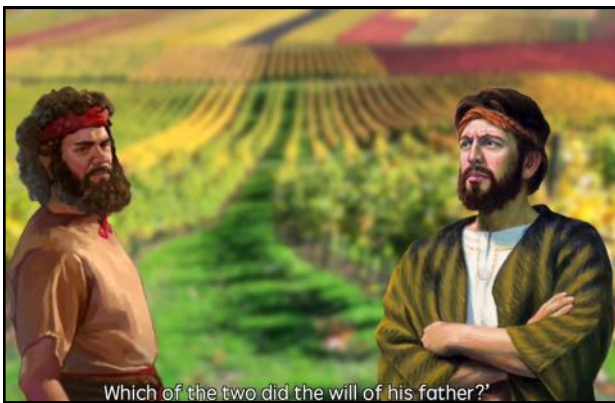
Which of the two did the will of his father?