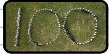
Current St. Malachy students form a 100

SATURDAY, FEB. 3: 5:00 PM SUNDAY, FEB. 4: 8:15 AM & 10:30 AM