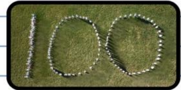
Current St. Malachy students form a 100

SATURDAY, FEB. 3: 5:00 PM SUNDAY, FEB. 4: 8:15 AM & 10:30 AM