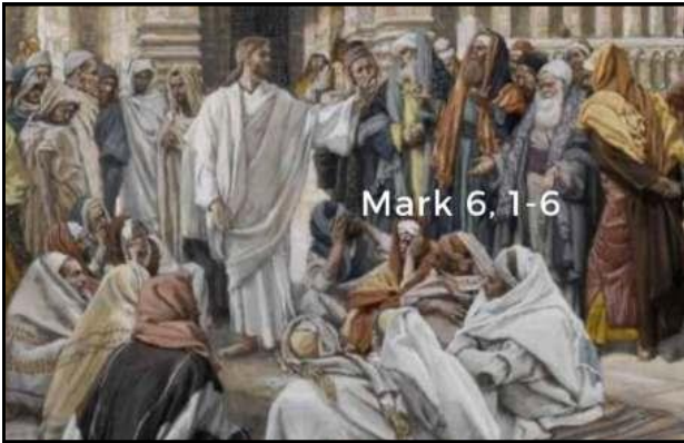
Mark 6, 1-6